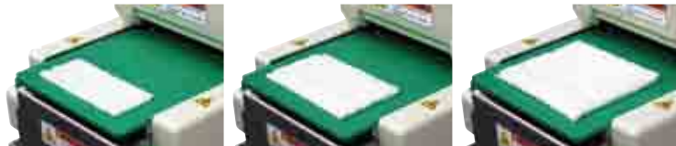
Small Roll Sheet

LCD operation touch panel can be displayed in either English, French, German, Spanish, Korean, Chinese, and Japanese by user selection on panel.