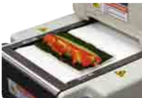
3. Place ingredients by hand