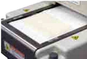
1. It spreads sushi rice onto the forming sheet