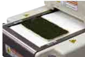
2. Place Nori (dried seaweed) by hand on the rice