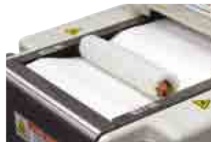
6. Forms beautiful rolls