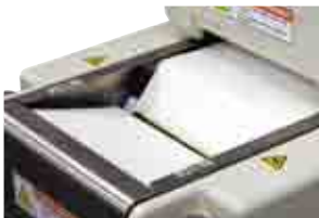
5. Automatically roll up