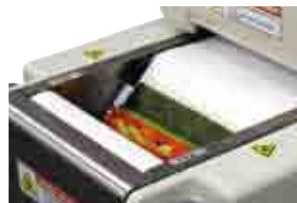
4. It starts rolling